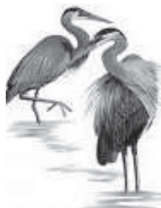
The Great Blue Heron's Wingspan 167 – 201 cm